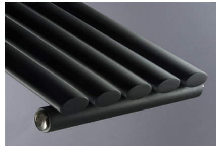
Ellipse 180/5 single matt black finish