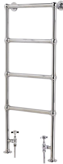
Moreton floor-mounted – LG021A

Luxury of times gone by. The superb finish and quality of the Moreton ball jointed towel radiator will bring stylish authenticity to your bathroom. This handsome range of ball jointed towel radiators are hand finished in the UK and made of solid brass finished with a luxurious coat of chrome (other metal finishes available by special order). Listed below are details of the most popular sizes (wall and floor mounted versions). Further sizes available by special order. These radiators are central heating as standard, but are also available in dual fuel and electric versions*. #as pictured (Moreton image in brochure is a bespoke size)